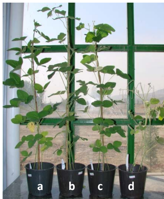
Figure 4 Effects of a: Bacillus sp. BIN, b: Trichoderma harzianum T100, c: Pantoea agglomerans on growth of foliar part of soybean in presence of Macrophomina phaseolina compared with control (d: M. phaseolina only) in greenhouse.

Analysis of greenhouse results showed that there were statistical differences among treatments in increasing soybean (Williams Cultivar) growth indices and inhibition of charcoal rot causal agent at 5% level in LSD test (Table 1). In pasteurized soil and presence of pathogen, T. harzianum T100 was the most effective antagonist against M. phaseolina and increased soybean fresh and dry root weights by 58.5% and 56.6% and fresh and dry foliage weights by 26.4% and 16.4%, respectively in comparison with control. Among bacterial antagonists, Bacillus sp. BIN was more effective than P. agglomerans . BIN isolate in pasteurized soil increased soybean fresh and dry root weights by 64.5% and 19.3% and fresh and dry foliage weights by 26.3% and 3.5%, respectively in comparison with control (Figure 4). Microsclerotial covering of root and stem was decreased by all antagonists by 72.7% in non-pasteurized and 62.5% by P. agglomerans and T. harzianum T100 and 87.6% by Bacillus sp. BIN in pasteurized soil (Table 1). Maneb in the presence of pathogen increased the host plant growth indexes by 87.6% and 82% in pasteurized and non-pasteurized soils, and decreased root and stem microsclerotial coverage by 87.6% and 82.3% in pasteurized and non-pasteurized soil, respectively.