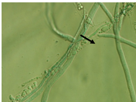
Figure 2 Mycelial interaction between Trichoderma harzianum T100 and Macrophomina phaseolina , Arrows show penetration sites of antagonist and lysis of pathogen cells.