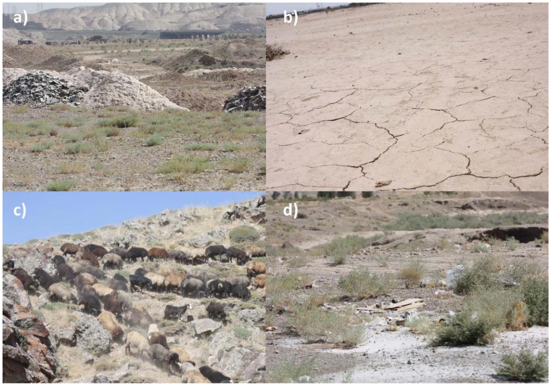
Figure 2 Main reasons for Orthoptera decline in Iran: a) habitat destruction for construction, b) desertification, c) overgrazing, and d) pollution.