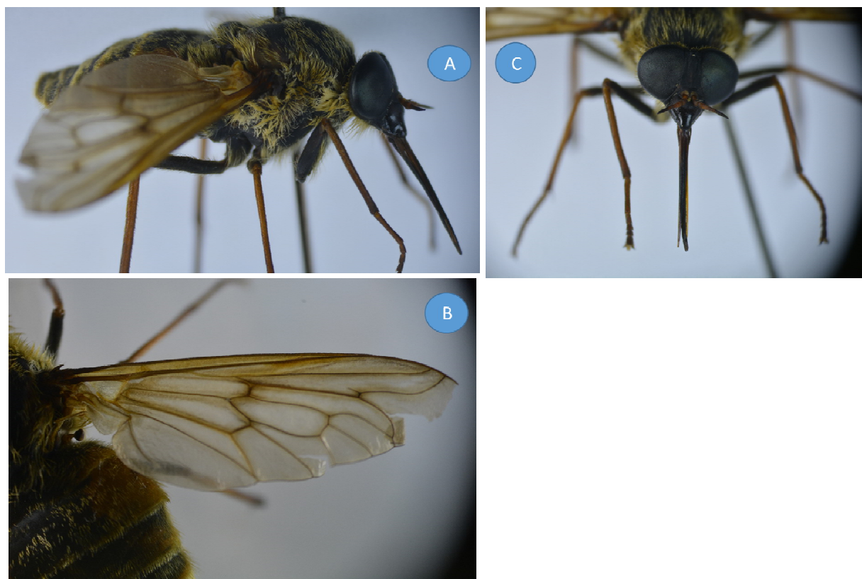
Figure 2 Pangonius pyritosus Loew, 1859 (Female), A: lateral view, B: wing, C: frontal view of head.