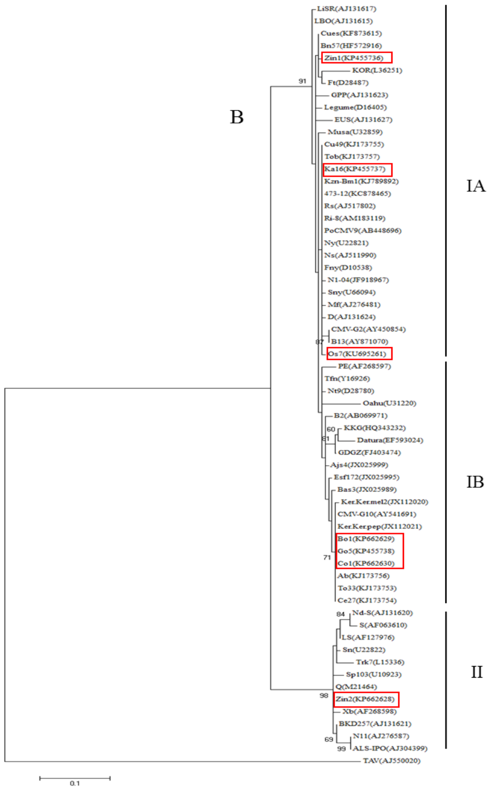
Figure 2 Continued.