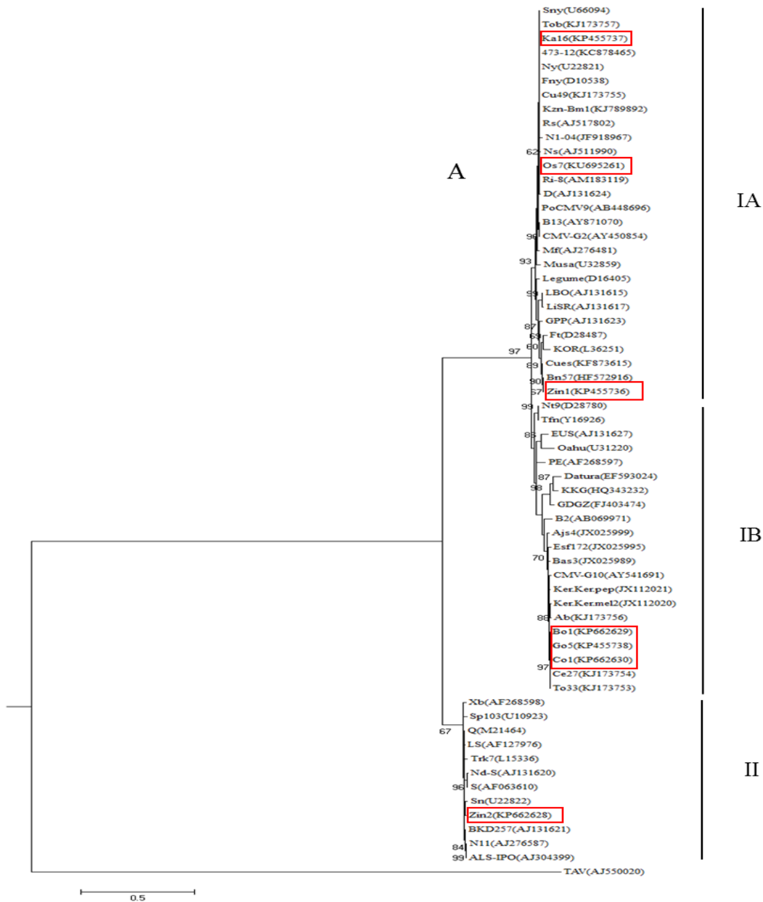
Figure 2 Nucleotide (A) and amino acid (B) phylogenetic tree of CMV isolates and reference CMV based on their coat protein sequences reconstructed by maximum likelihood analysis with 1000 bootstrap replication. The CP sequence of of Tomato aspermy virus (TAV) another Cucumovirus was used as outgroup. Bootstrap values greater than 60% are shown at the nodes. Iranian isolates of CMV in current study are boxed (Figure 2 continued in the next page).