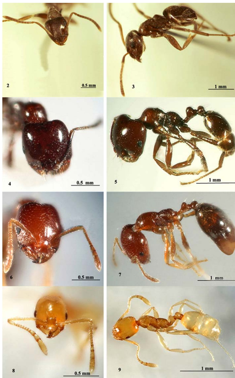
Figures 2-9 Morphological characteristics of newly recorded species of ants from Iran. 2-3 Lasius paralienus (worker): 2 Head in frontal view, 3 Alitrunk in profile view. 4-5 Monomorium libanicum (worker): 4 Head in frontal view, 5 Alitrunk in profile view. 6-7 Monomorium mayri (worker): 6 Head in frontal view, 7 Alitrunk in profile view. 8-9 Monomorium qarahe (worker): 8 Head in frontal view, 9 Alitrunk in profile view.