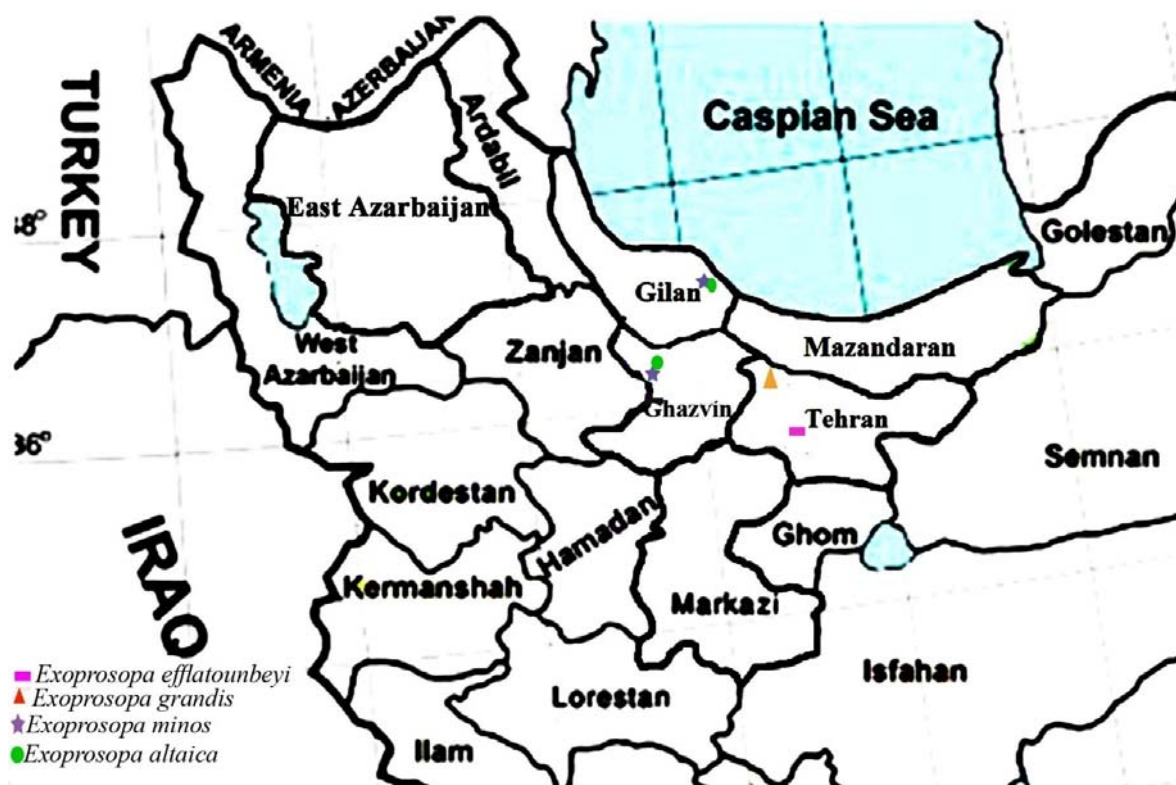
Figure 1 Northern Iran where Exoprosopa specimens were collected.