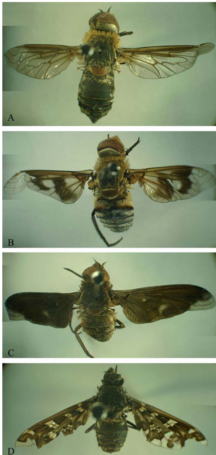
Figure 3 General habitus of Exoprosopa species (dorsal view); A) E. minos , B) E. grandis , C) E. efflatounbeyi , D) E. altaica .