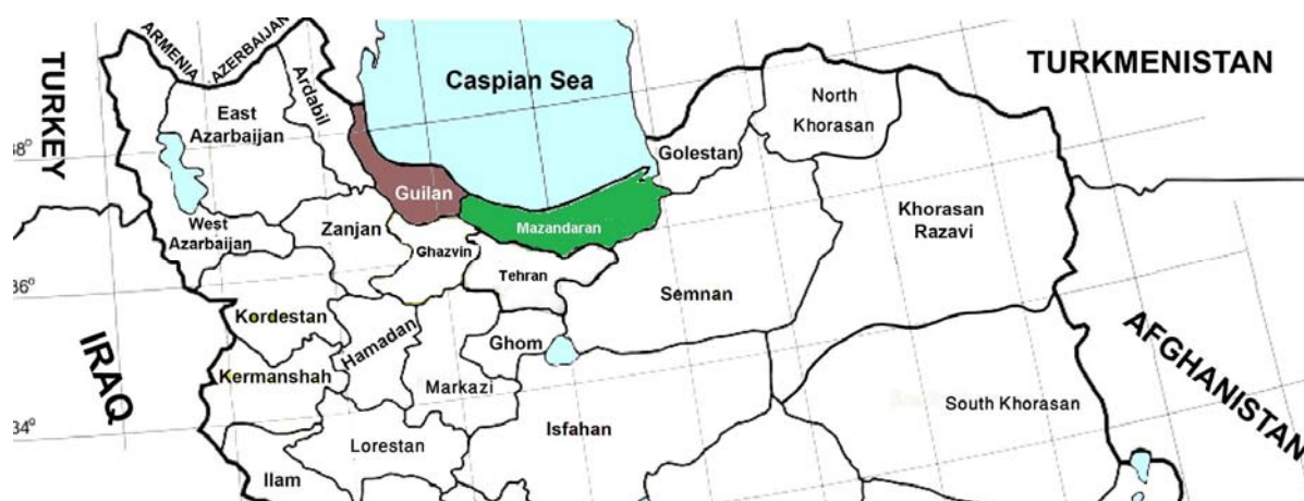
Figure 1 Map of the sampling provinces in north of Iran, where the specimens of Pipiza accola have been collected.