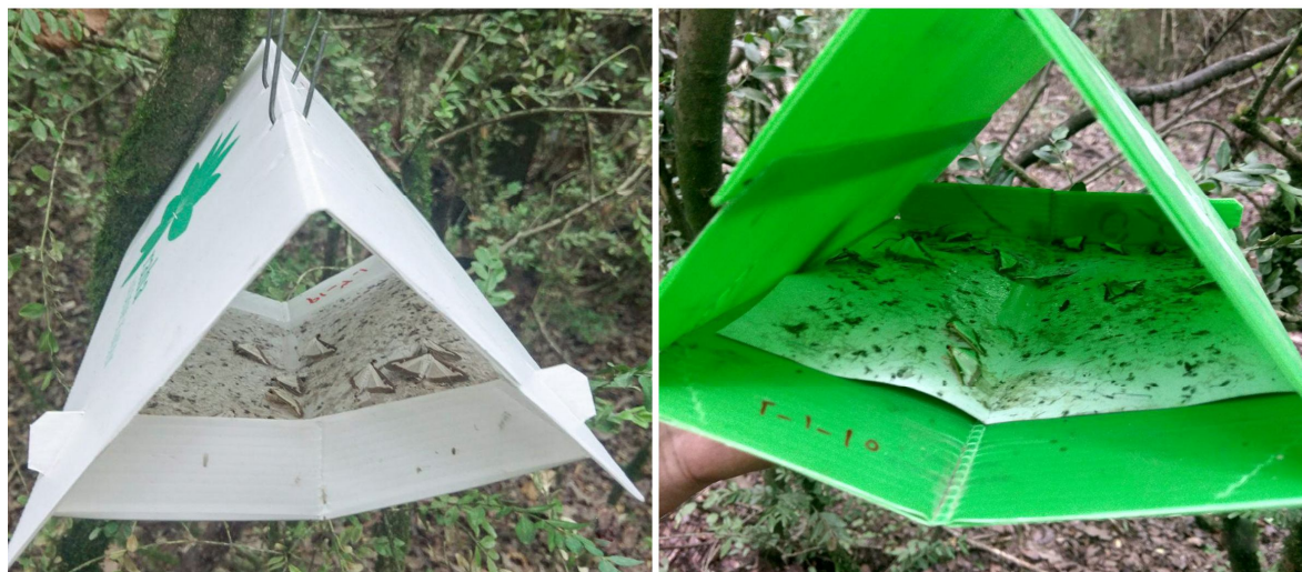
Figures 3 Two different colors (white and green) of delta shape pheromone traps installed in Cheshmeh-Bolbol for capturing Cydalima perspectalis .