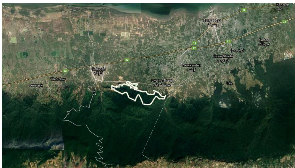
Figure 1 Map of Cheshmeh-Bolbol Box Reservoir (Golestan province) where this study was done.

68 green color and 92 white color traps were used for this experiment (Fig. 3). The traps were distributed randomly between boxwood trees at the approximate distance of 80-100m between traps. Captured males of BTM were counted and recorded every two days till the end of moth's last generation activity.