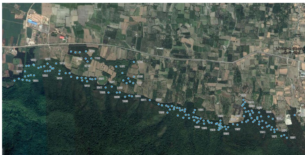
Figure 2 Map of pheromone traps (blue dots) located in Cheshmeh-Bolbol Box Reservoir, Golestan province.