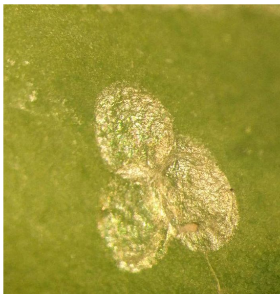
Figure 6 Infertile eggs of Cydalima perspectalis from 3 rd generation.