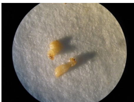
Figure 1 A photograph of dead termites exposed to eucalyptus essential oil.

*Means followed by the same letter in a column are not significantly at 5% probability level (LSD).