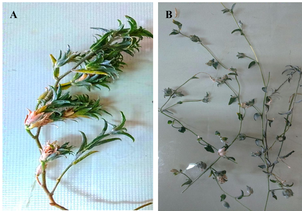
Figure 1 (A) Symptoms of witches' broom, little leaf and yellowing (B) in comparison with healthy Convolvulus glomeratus .

phytoplasma infection. So, this study was carried out to identify the phytoplasma associated with C. glomeratus and the insect vector in Iran.