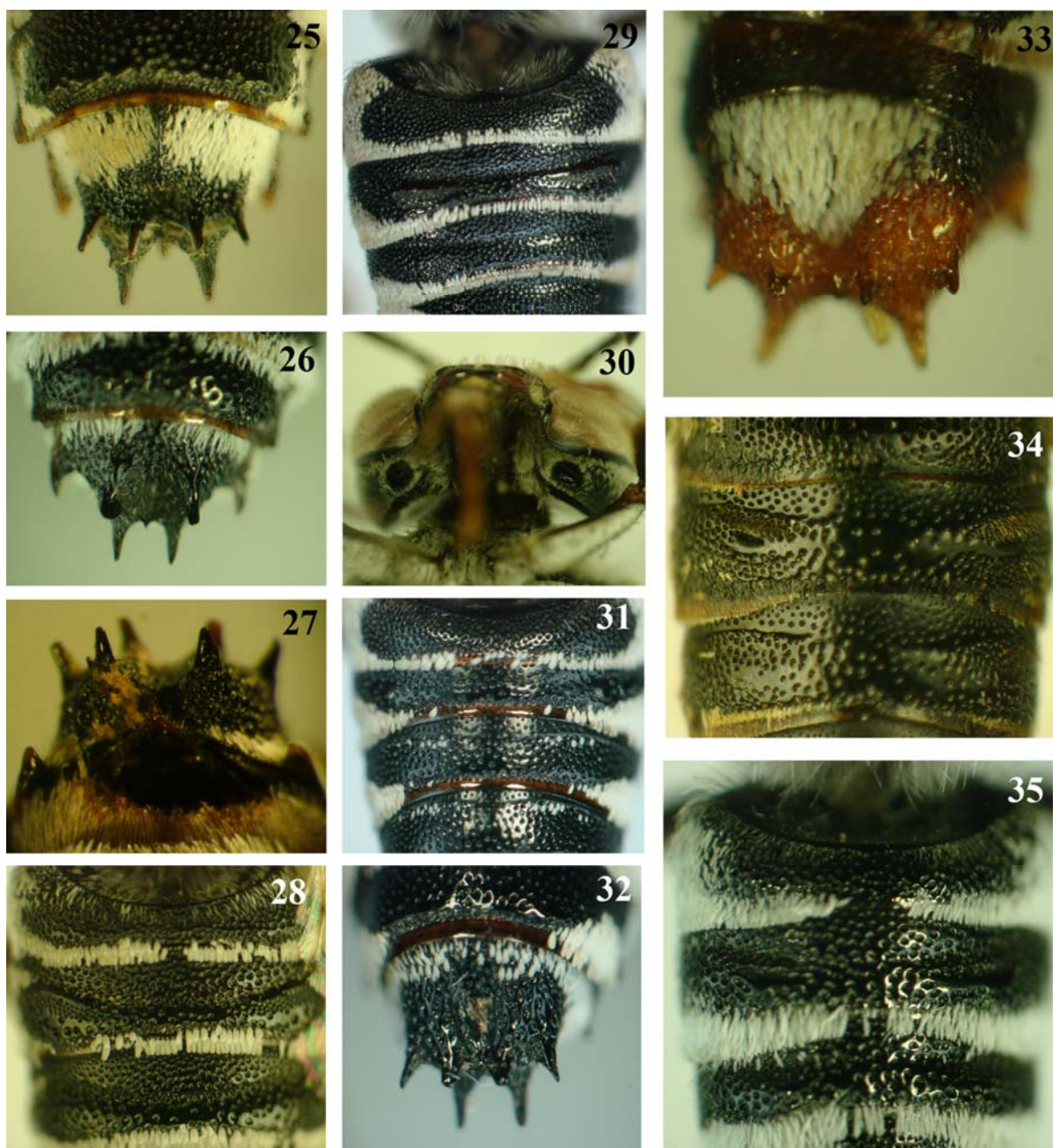
Figures 25-35. 25- Coelioxys acanthura : tergum VI, 26- Coelioxys quadridentata : tergum VI, 27-28- Coelioxys acanthura : 27- tergum VII, 28- tergum II, 29- Coelioxys brevis : tergum II, 30-32- Coelioxys afra : 30-genal fossa, 31- tergum II, 32- tergum VI, 33- Coelioxys haemorrhoea : tergum VI, 34- Coelioxys inermis : tergum II, 35- Coelioxys quadridentata : tergum II.