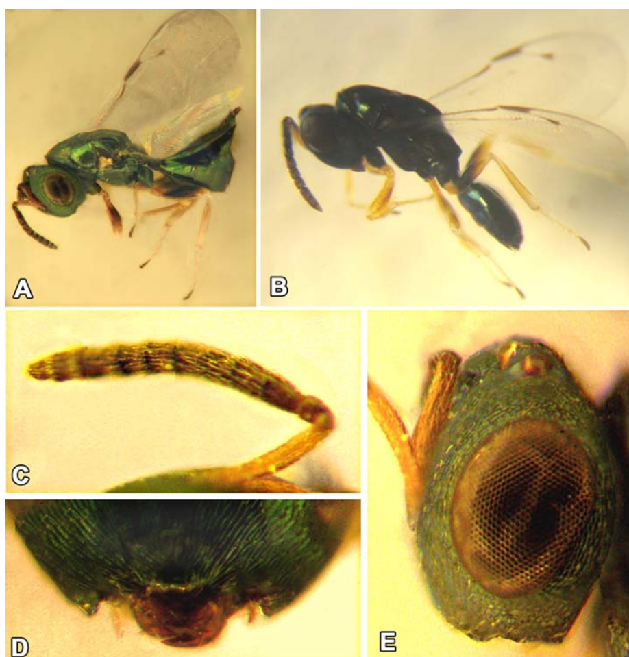
Figure 2 Pachyneuron solitarium : (A): female in lateral view, (B): male in lateral view, (C): female antenna, (D): clypeus in frontal view (E): Head in lateral view.