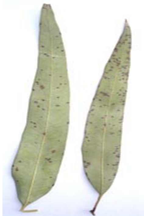
Figure 4 Pseudocercospora sp.: symptom on Eucalyptus sp.

Specimens examined: On Eucalyptus sp., Guilan, Shanderman, July 4 2007, M. Zahedi (809).