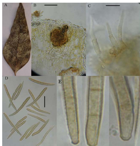
Figure 1 Kirramyces epicoccoides (A) symptom on Eucalyptus leaves associated with the fungus (B) cross section of pycnidia (C) annelidic proliferation on conidiogenous cells (D) conidia (E) verruculose conidia showing basal cell, scale bar = 50 \mu\text{m} for B, 20 \mu\text{m} for C, D A and E not scaled.