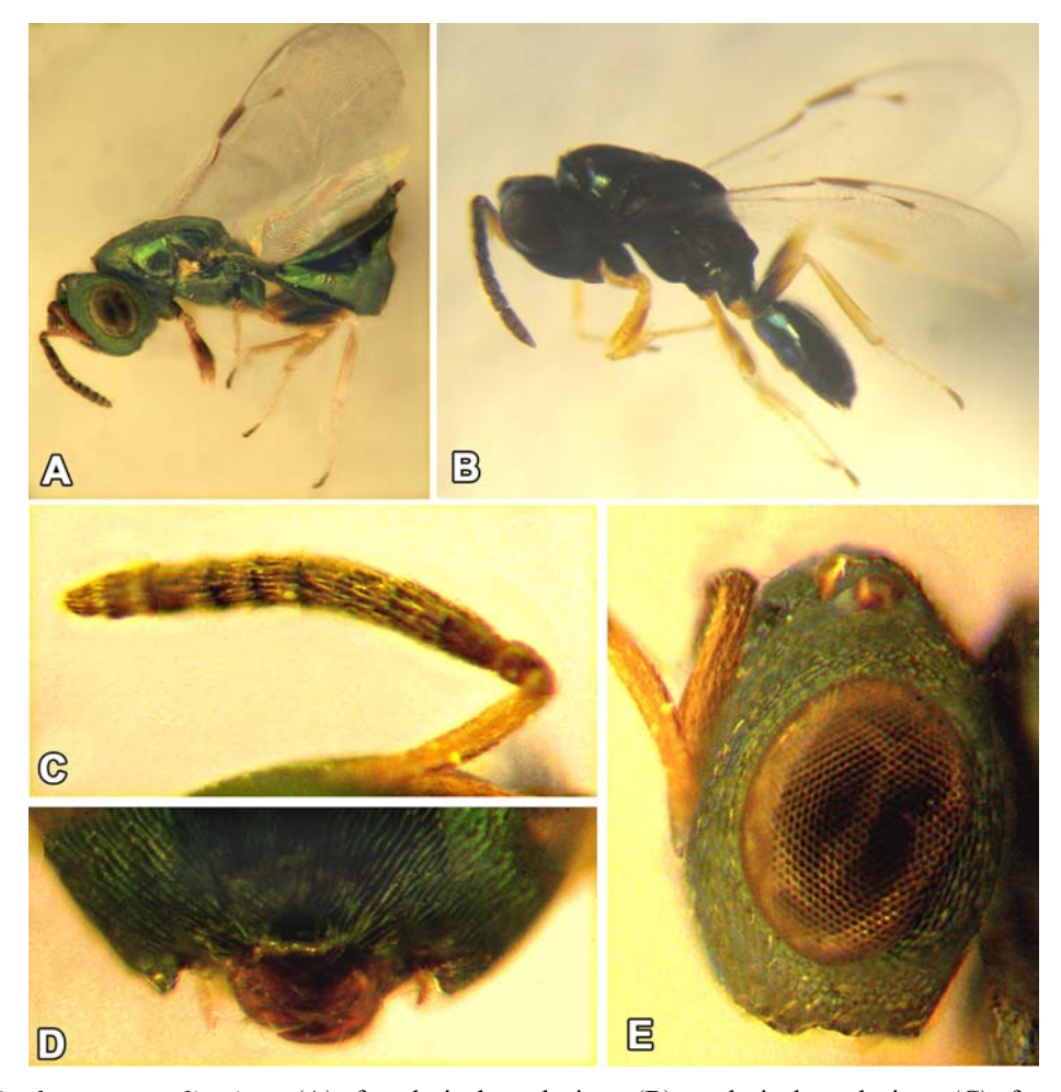
Figure 2 Pachyneuron solitarium: (A): female in lateral view, (B): male in lateral view, (C): female antenna, (D): clypeus in frontal view (E): Head in lateral view.