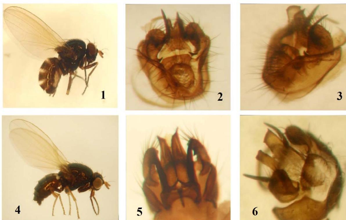
Figure 1-6 Morphological characteristics of Iranian Lauxaniidae; 1. Calliopum aeneum (Fallén, 1820) (lateral habitus, male), 2. C. aeneum (Fallén, 1820) (male genitalia, dorsal view), 3. C. aeneum (Fallén, 1820) (male genitalia, lateral view), 4. Calliopum caucasicum (Shatalkin, 1995) (lateral habitus, male), 5. C. caucasicum (Shatalkin, 1995) (male genitalia, ventral view), 6. C. caucasicum (Shatalkin, 1995) (male genitalia, dorsal view).

Material examined: East Azerbaijan: Tanbaklo, 38°54' N, 47°13' E, 1367 m a.s.l., 15 June 2011 (moist grassland habitat), 1 ♀, 3 ♂; Gharedarvish, 38°54' N, 47°15' E, 1416 m a.s.l., 5 June 2013 (forest and grassland habitat), 2 ♀, 2 ♂ (3 ♀, 5 ♂, IMTU), leg. S. Khaghaninia.