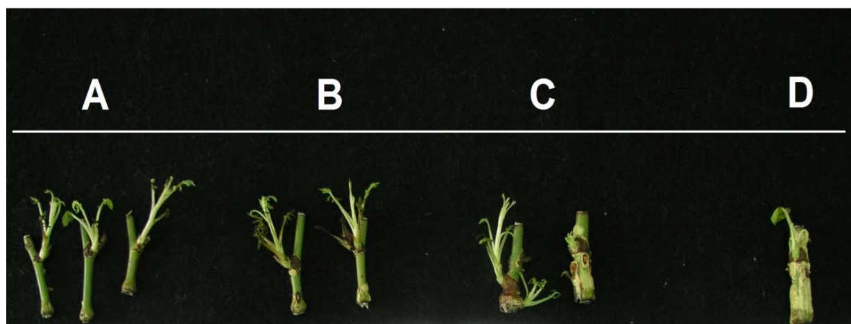
Figure 2 Effects of ribavirin treatment with different concentrations for a period of 40 days on the survival of rose explants grown in vitro : untreated control (A); treated with 10 mg/l (B); 20 mg/l (C); and 30 mg/l (D) of ribavirin.