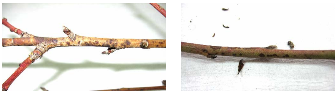
Figure 1 Symptoms of shot hole disease on peach shoots in current season (left) and last season (right).