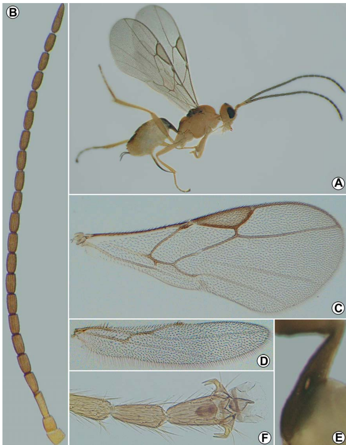
Figure 3 The external morphology of Syntretus (Syntretus) xanthocephalus : A. Adult female, lateral view of general habitus; B. antenna; C. Forewing; D. Hind wing; E. First metasomal tergite; F. Last tarsal segments and tarsal claws.