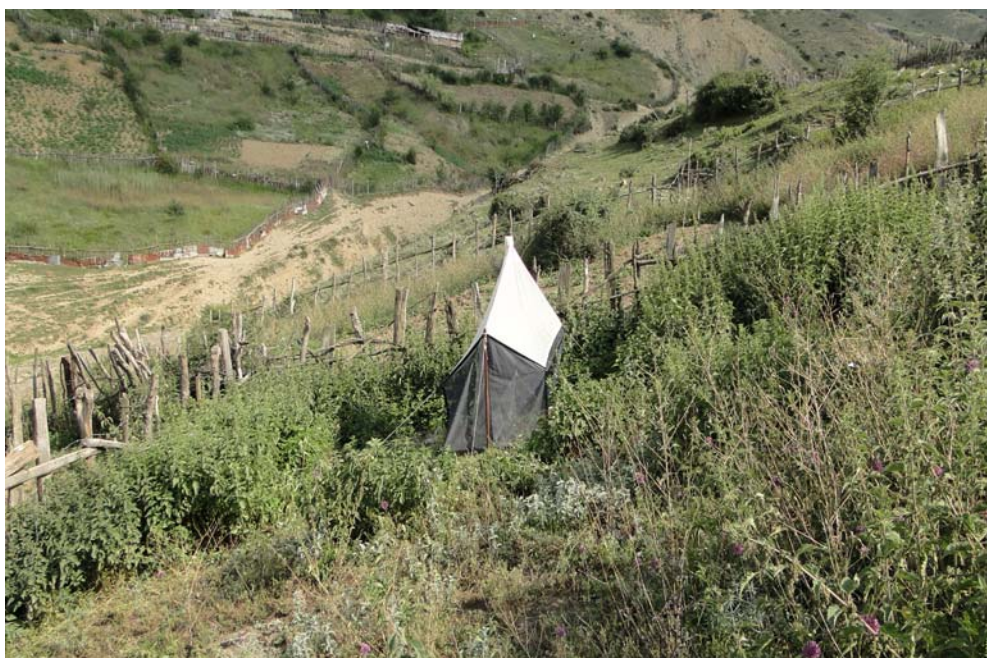
Figure 1 The habitat in which specimens were collected by Malaise trap (Gaznasara).

- Laterope deep (Fig. 3E); median carina of propodeum absent; length of ovipositor sheath 0.15 times as long as fore wing (Fig. 3A); vein 1-R1 of fore wing 1.4 times as long as pterostigma (Fig. 3C); eyes 1.1 times as long as temple in dorsal view; scutellum distinctly convex; antenna with 22 segments (Fig. 3B)..... S. xanthocephalus