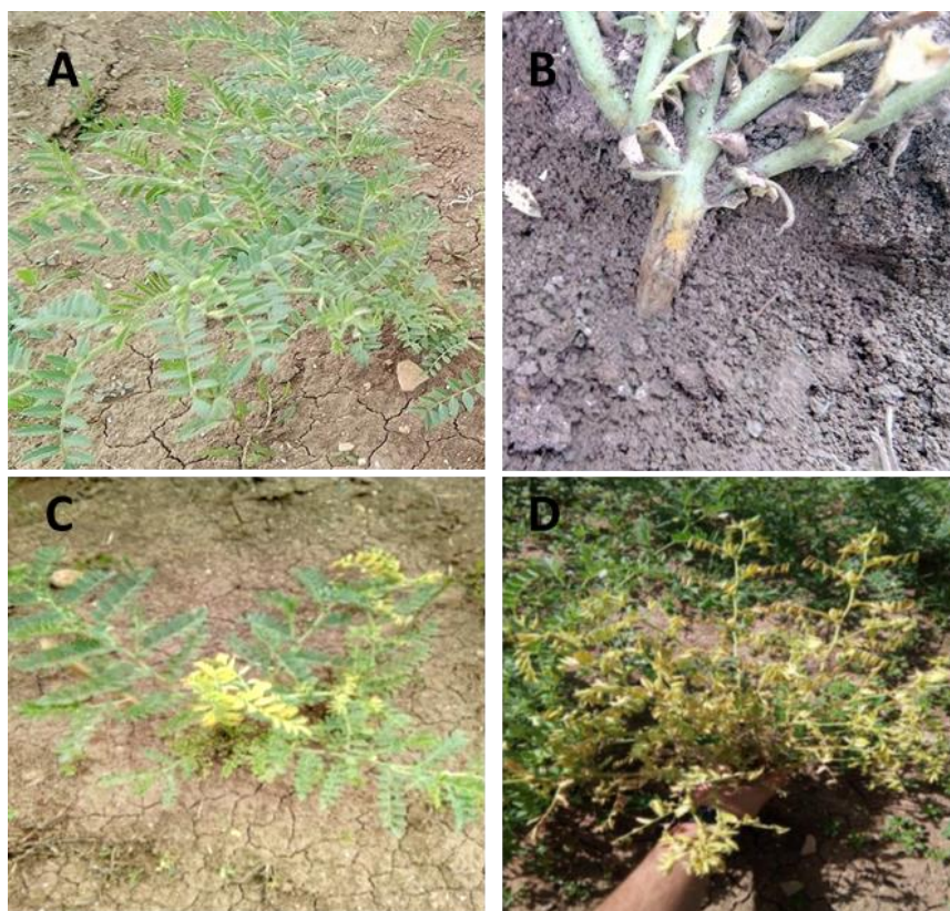
Figure 1 Symptoms observed with Fusarium wilt disease on chickpeas plants. A: Healthy plant; B: Collar necrosis; C: Yellowing plant; D: Wilting plant.

Regarding the ISM and according to the scale of El-Aoufir (2001), we can classify the disease as moderately severe on 8 genotypes (Flip 11-172 C, Flip 11-176 C, Flip 11-124 C, Flip 11-149 C, Flip 11-142 C, Flip 10-354 C, Flip 11-23 C, Flip 10-380 C), as serious disease on 22 genotypes (Flip 11-52C, Flip 10-368C, Flip 11-24 C, Flip 10-358 C, Flip 11-144 C, Flip 11-143 C, Flip 10-382 C, Flip 11-186 C, Flip 11-69 C, Flip 10-357 C, Flip 11-150 C, Flip 11-227 C, Flip 10-350 C, Flip 11-123 C, Flip 11-204 C, Flip 11-223 C, Flip 11-49 C, Flip 11-68 C, Flip 10-376 C, Flip 11-77 C, Flip 11-35 C and Flip 11-159 C) and very serious disease on 11 genotypes (Flip 11-37 C, Flip 11-122 C, Flip 11-83 C, Flip 11-48 C, Flip 11-90 C, Flip 11-116 C, Flip 11-115 C, Flip 11-152 C, ILC482, Flip 11-82 C and Flip 11-121 C) (Table 3).