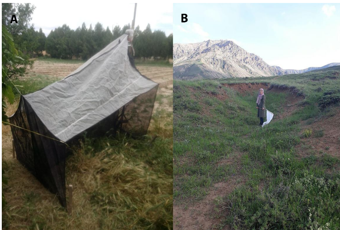
Figure 1 Habitats of collected specimens of Inostema species in the northwest of Iran, via a Malaise trap in Khosroshah (A) and a net in Marand (B).

Keys to species of this genus for many European species are given by Szelenyi (1938), European USSR (Kozlov, 1978), Fennoscandia Denmark (Buhl, 1999) and India (Mukerjee, 1981). Identification results were consequently confirmed by Dr. Peter Neerup Buhl (Natural History Museum of Denmark, University of Copenhagen). Photos were taken using a BK Lab System by Visionary Digital and also Zerene Stacker 1.04 (Zerene Systems LLC, Richland, Washington, USA) for focus stacking and assemblage and illustrations in the plates were done in Adobe Photoshop CS4® software.