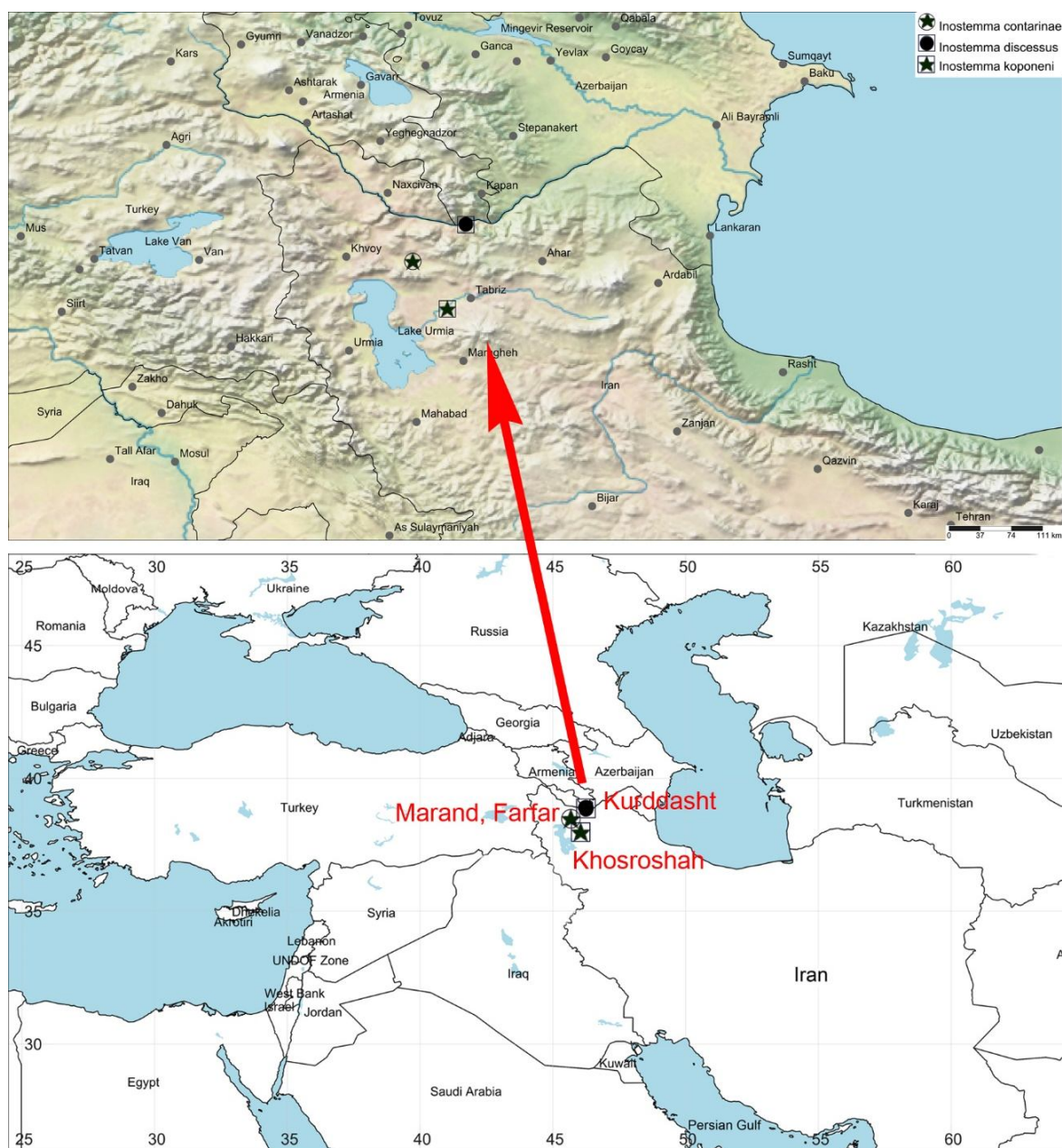
Figure 2 Collection localities of Inostemma species in the northwest of Iran.

Voucher specimens are deposited in the insect collection of the Plant Protection Research Department, East-Azərbayjan Research & Education Center for Agriculture and Natural resources, Tabriz, Iran.