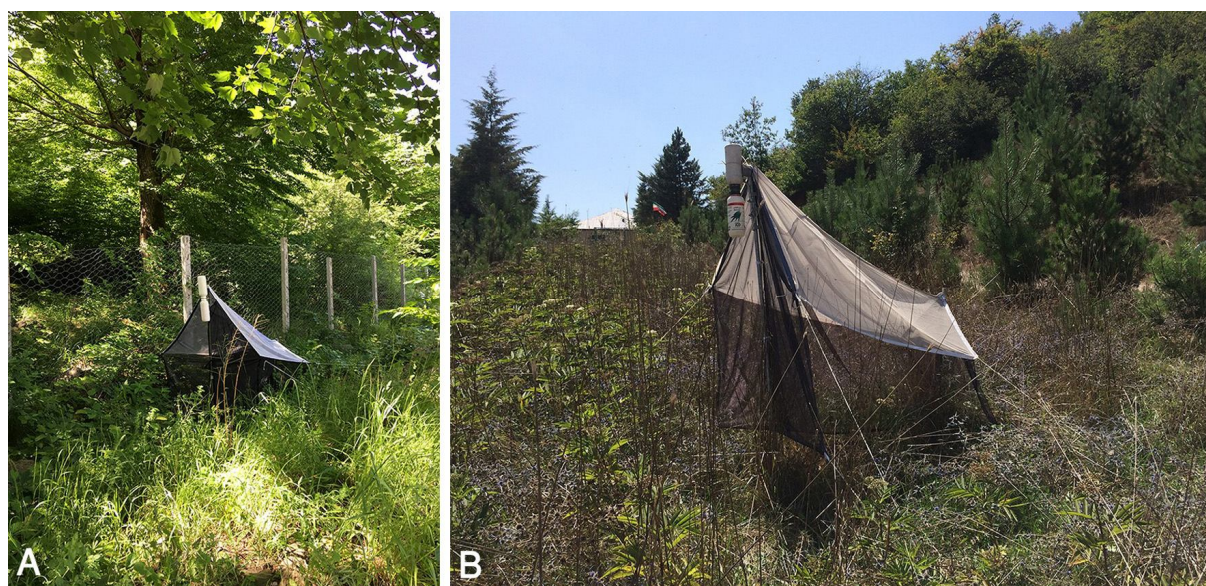
Figure 1 Habitats of northern Iran where the specimens were collected A. Golestan, Ali Abad, Zarin Gol village, B. Mazandaran province, Alikola.

Material for this study was collected from northern area of Iran during 2010–2017 using Malaise traps (Figs. 1A, B). The specimens were extracted from the traps monthly, transferred to 70% ethyl alcohol, and stored in a freezer for subsequent examination. For the preparation of samples, they were transferred to a 96% mixture of 40% xylene and 60% alcohol, moved after 2 days to amyl acetate for one day, and finally placed on a piece of absorbing paper for drying (AXA method; van Achterberg, 2009). The dried specimens were card-mounted and labeled. Illustrations were done using an Olympus AX70 microscope and Olympus SZX9 stereomicroscope equipped with a BMZ-04-DZ digital imaging system (Behin Pajouhesh Co., Iran). A series of 4 or 5 captured images were merged into a single in-focus image using the image-stacking software Combine ZP1.0. Morphological terminology follows Nixon (1980) and Masner and Garcia (2002). Specimens are deposited in the insect collection of the Department of Entomology, Tarbiat Modares University, Tehran (TMUC) and the Research Institute of Forests and Rangelands, Tehran (RIFR).