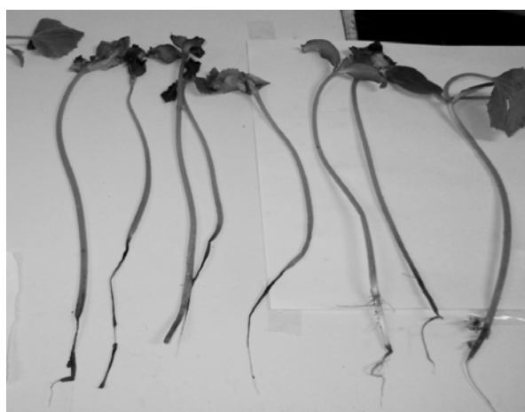
Figure 3 Ten-day-old cantaloupe seedlings inoculated with P. aphanidermatum .