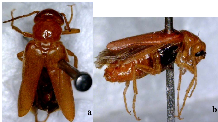
Figure 2 Ctenopus sinuatipennis , a. dorsal view, b. lateral view.

Distribution: Europe: Azerbaijan, Armenia; Asia: Kazakhstan, Turkmenistan, Uzbekistan and Tajikstan (Löbl & Smetana, 2008), Iran (East Azarbaijan, Markazi, Tehran and other northern provinces) (Modaress Awal, 2012).