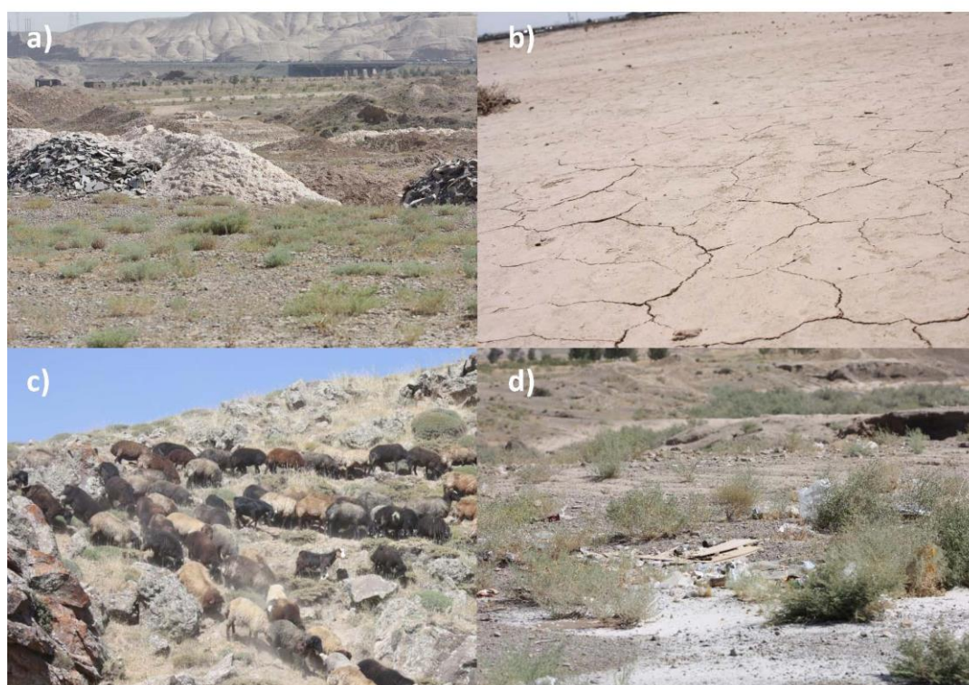
Figure 2 Main reasons for Orthoptera decline in Iran: a) habitat destruction for construction, b) desertification, c) overgrazing, and d) pollution.