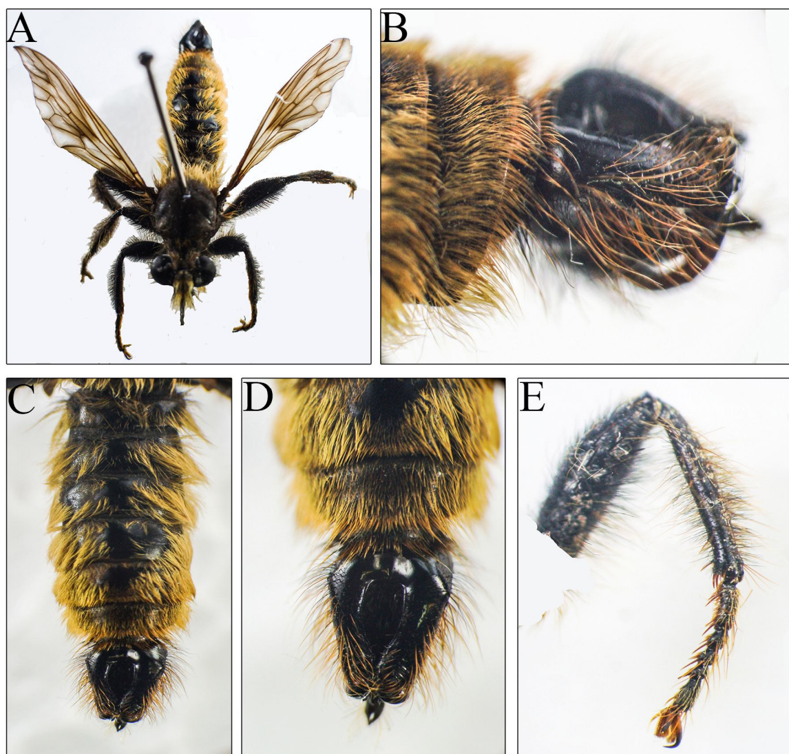
Figure 1 Laphria caspica Hermann, 1906, A-E: Male. A: general habitus, dorsal view; B:genitalia, lateral view; C: abdomen, dorsal view; D: genitalia, dorsal view; E: leg, lateral view.

dense, dpressed light yellow or white hairs; body length 15-28 mm..... L. gibbosa (L.) 3b- Abdominal tergites more or less covered with dense, erect yellow hairs (Figs. 1A, 1C, 1D).....4 4a- Hairs along the median line of all abdominal tergites sparse and short; body length 18-21mm (Figs. 1A, B, C, D)..... L. caspica Hermann 4b- Hairs on abdominal tergites more or less of equal length; body length 12-24mm... L. flava (L.)