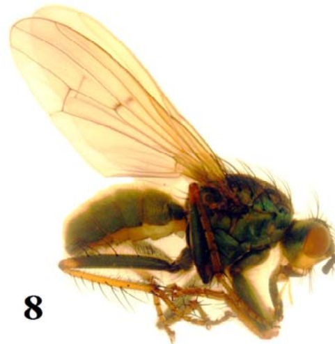
Figure 5-8 Habitus, lateral view. 1. Scathophaga jezeki (Šifner, 1981) (alcoholic specimen), 2. Scathophaga kaszabi (Šifner, 1975) (dry specimen), 3. Scathophaga lutaria (Fabricius, 1794) (dry specimen), 4. Scathophaga stercoraria (Linnaeus, 1758) (Fallén, 1819) (alcoholic specimen).