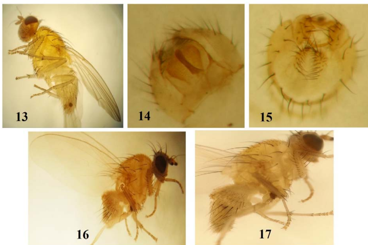
Figure 13-17 Morphological characteristics of Iranian Lauxaniidae; 13. Minettia hyrcanica (Shatalkin, 1998) (lateral habitus, male), 14. M. hyrcanica (Shatalkin, 1998) (male genitalia, ventral view), 15. M. hyrcanica (Shatalkin, 1998) (male genitalia, dorsal view), 16. Sapromyza biordinata (Czerny, 1932) (lateral habitus, female), 17. S. biordinata (Czerny, 1932) (lateral habitus, female).

Diagnosis: 0 + 3 or 0 + 2 dc; Postpronotum with one bristle; lateral part of thorax without stripes; angle between frons and face about 135°; halter yellow; length of arisal rays more than width of third antennal segment; thorax mostly yellow; mesonotum entirely yellow; scutellum without spots; palpus yellow; only abdominal tergite V with spots and length, 4.8 mm.