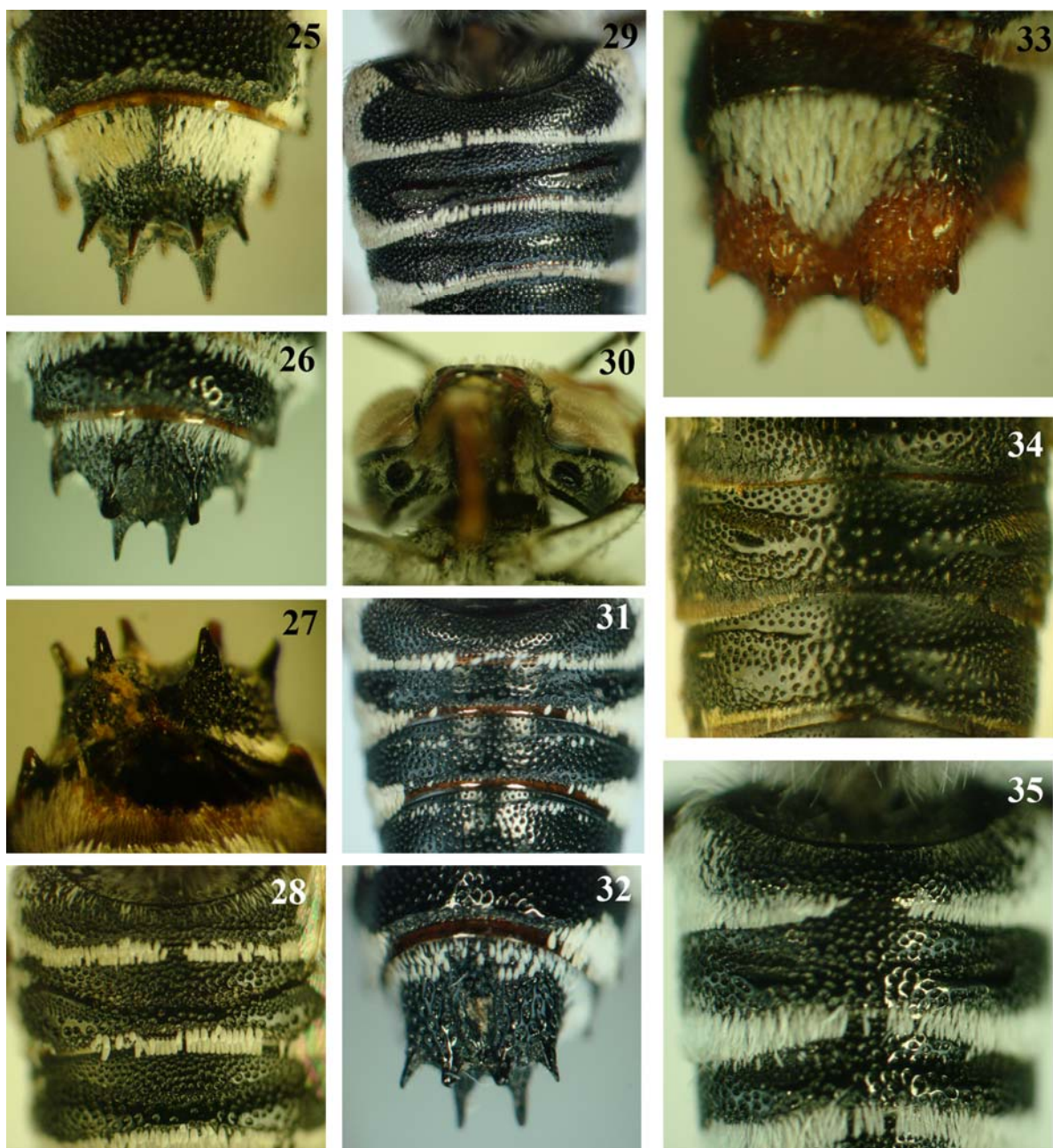
Figures 25-35. 25- Coelioxys acanthura : tergum VI, 26- Coelioxys quadridentata : tergum VI, 27-28- Coelioxys acanthura : 27- tergum VII, 28- tergum II, 29- Coelioxys brevis : tergum II, 30-32- Coelioxys afra : 30- genal fossa, 31- tergum II, 32- tergum VI, 33- Coelioxys haemorrhhoa : tergum VI, 34- Coelioxys inermis : tergum II, 35- Coelioxys quadridentata : tergum II.